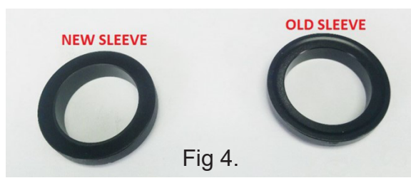
New and old debris sleeve