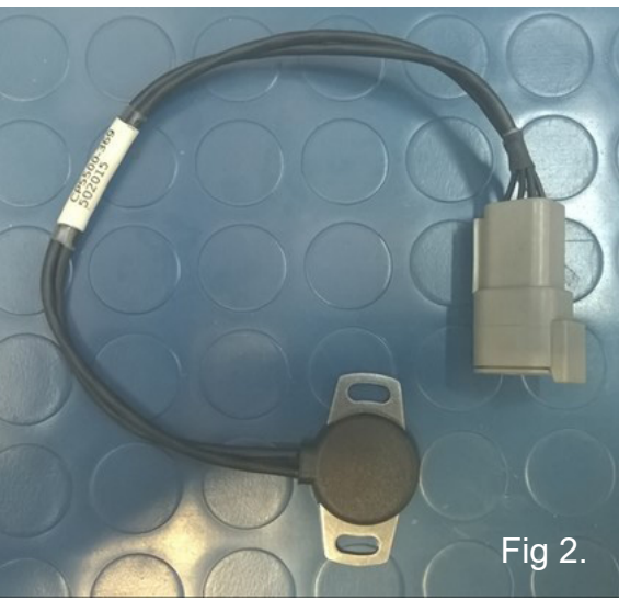
Old sensor with Deutsche DTM plug